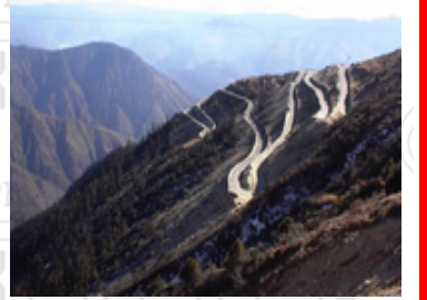
Bum La Pass