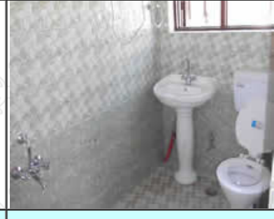
Hotel Photos for Super Deluxe Tour (Hotel Tariff Approx Rs. 3800/- To 4500/- Per Day / Per Room Without Any Food)